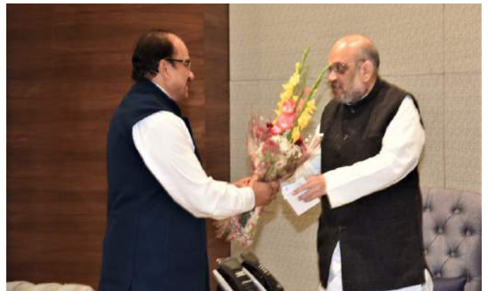
Sh. Deepak Jain, DG-FII with Sh. Amit Shah Ji, Hon'ble Home Minister of India