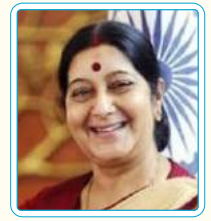
Padma Vibhushan L. Smt. Sushma Swaraj