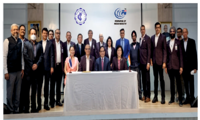
MOU signing between FII and ITCC Thailand in Bangkok (Jan 2022)