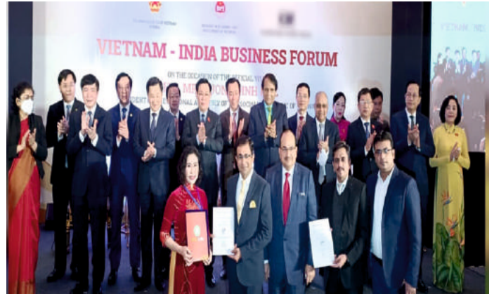
MOU signing between FII and Invest Global Vietnam in New Delhi (Dec 2021)