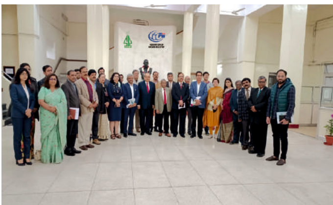
Federation of Indian industry (FII) signed an MOU with Sri Ram Institute (SRI) for Industrial Research New Delhi (Feb 2022)