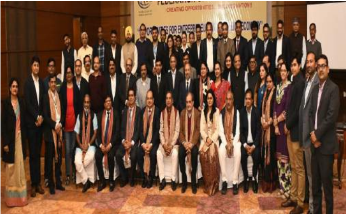
FII Seminar on "Opportunities for Entrepreneurs in 5 Trillion Economy" in New Delhi (Feb 2020)