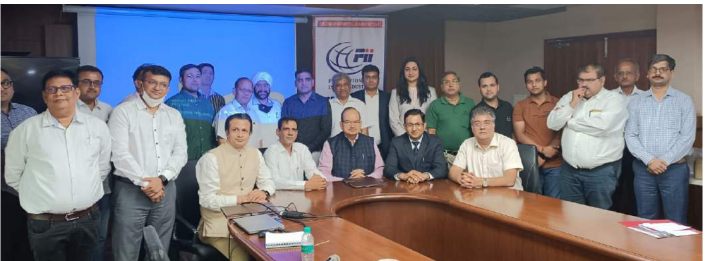
MOU signing between FII and NASSCOM COE Gurugram in Haryana (April 2022)