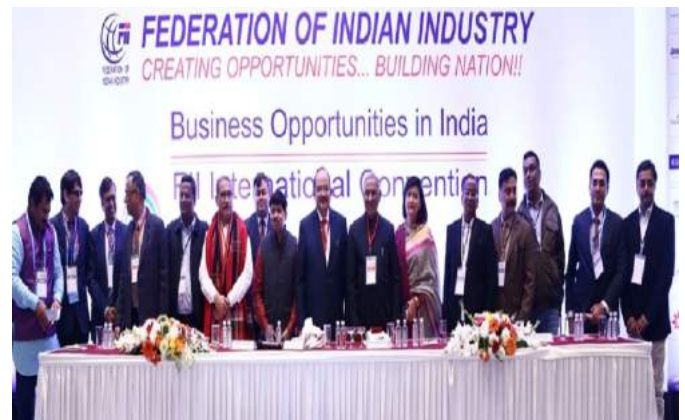
Team FII at FII Global Convention "Business Opportunities in India" in Varanasi (Jan 2019)