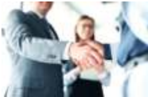
Supporting States in Ease of Doing Business