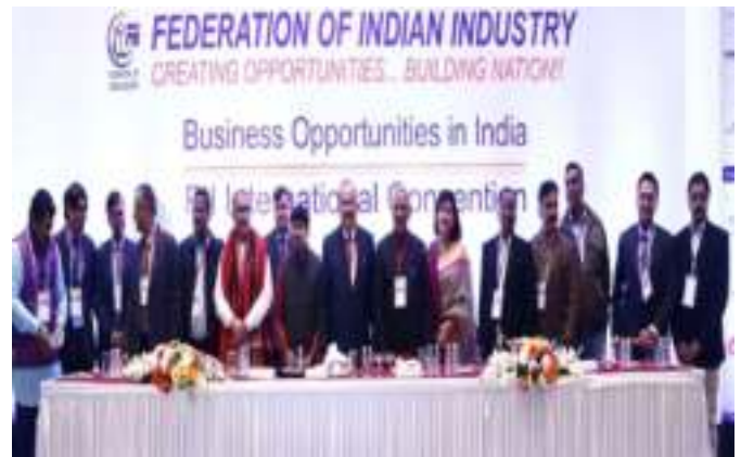
Team FII at FII Global Convention “Business Opportunities in India” in Varanasi (Jan 2019)