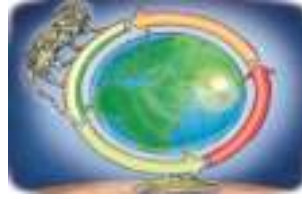
And Make For the World