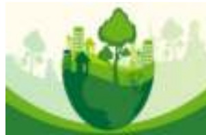
Supporting The Startup Ecosystem