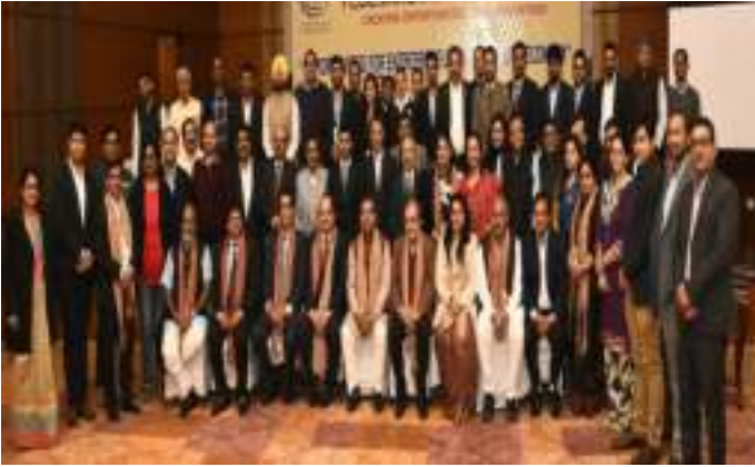
FII Seminar on “Opportunities for Entrepreneurs in 5 Trillion Economy” in New Delhi (Feb 2020)