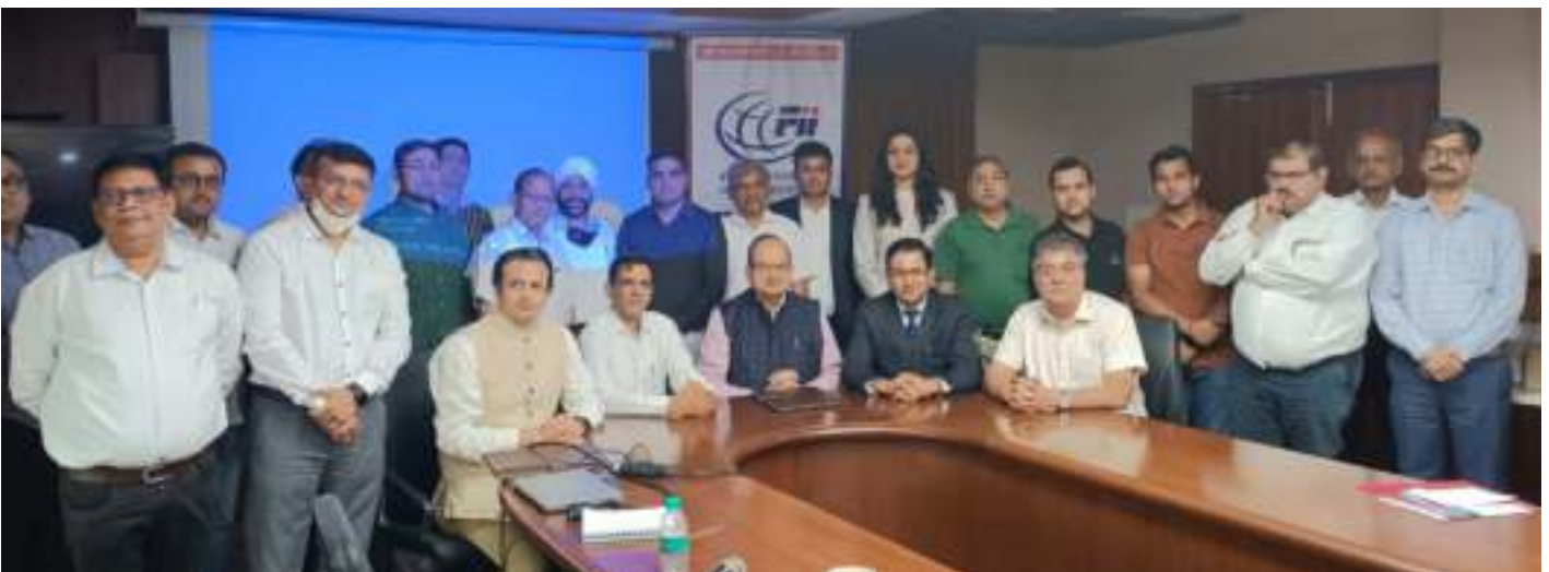
MOU signing between FII and NASSCOM COE Gurugram in Haryana (April 2022)