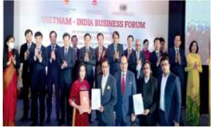
MOU signing between FII and Invest Global Vietnam in New Delhi (Dec 2021)