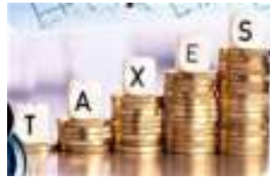
Helping Industry In Taxation Policy