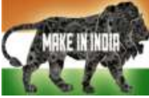
Supporting Make In India