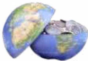
Helping States and Nations In Mobilising Resources