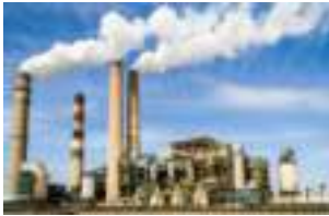
Helping Industry Create Global footprint