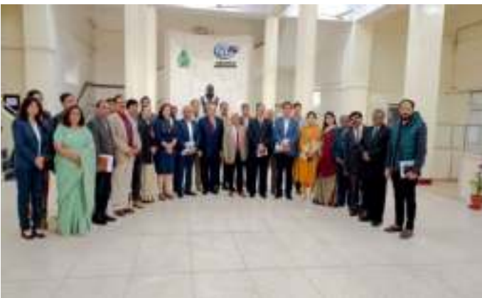
Federation of Indian industry (FII) signed an MOU with Sri Ram Institute (SRI) for Industrial Research New Delhi (Feb 2022)