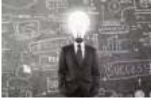
Helping Entrepreneurial Skill Development