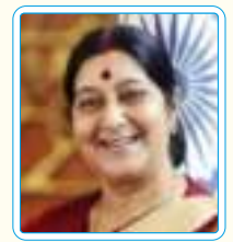
Padma Vibhushan L. Smt. Sushma Swaraj