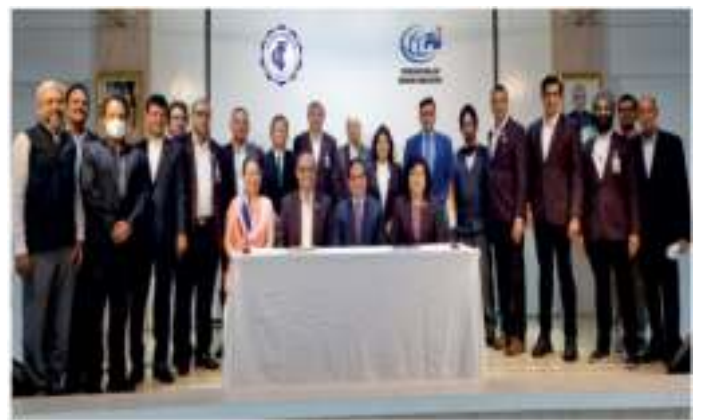
MOU signing between FII and ITCC Thailand in Bangkok (Jan 2022)