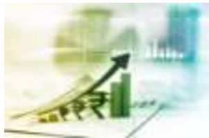
Supporting States in Improving Industrial Policies