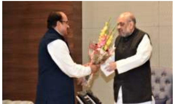
Sh. Deepak Jain, DG-FII with Sh. Amit Shah Ji, Hon'ble Home Minister of India