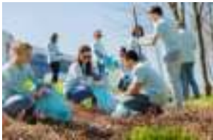
CONDUCTING CSR ACTIVITIES